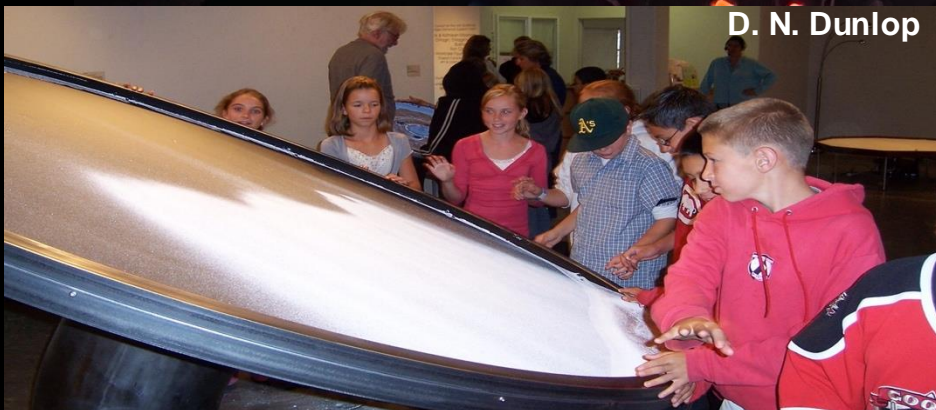
Particles in Motion Exhibit 2006

SBC # 542 • April 14, 2025 Quantum Biology and the Dynamics of Consciousness Fresh from Los Alamos National Lab - Charles Ostman, PhD